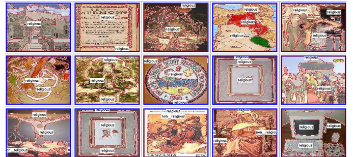
Figure 4: “Religious” regions after five iterations.