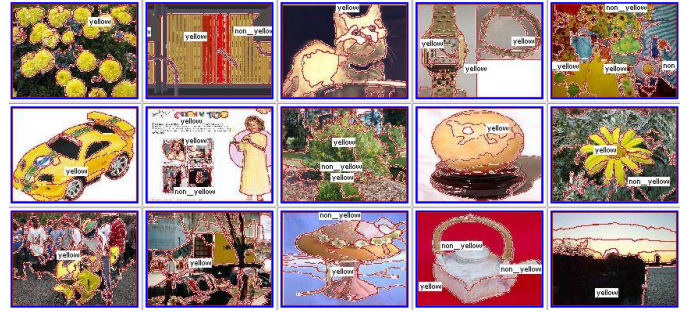
Figure 1: “Yellow” regions after one iteration.